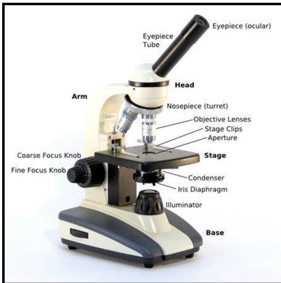
Fig1. Components of a Light microscope .

Monocular microscopes have one eyepiece, while binocular microscopes have two eyepieces.